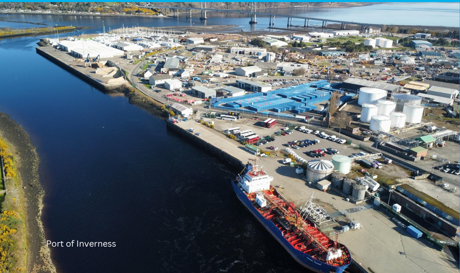
Port of Inverness