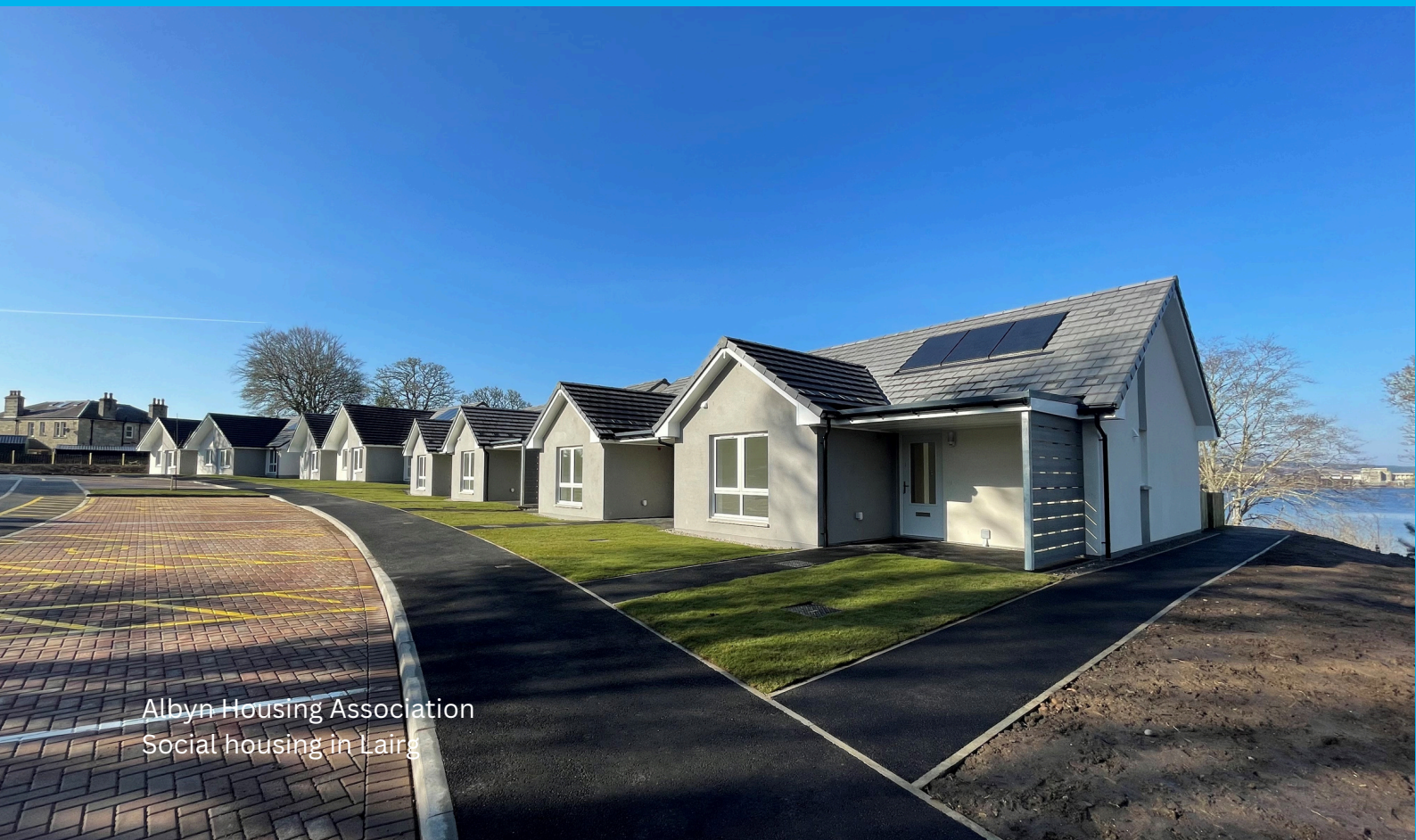
Albyn Housing Association Social housing in Lairg