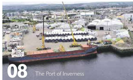
08 The Port of Inverness