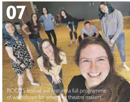
07 ROOTS festival will feature a full programme of workshops for emerging theatre makers.

ROOTS is supported in-kind by the Spectrum Centre; funded in part by the National Lottery via Creative Scotland; and funded in part by Start-It! from the Social Entrepreneurs Fund, delivered by First Port.