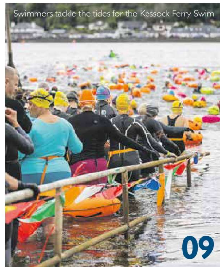
Swimmers tackle the tides for the Kessock Ferry Swim

For more information, please read the Board Member Application Information available at www.portofinverness.co.uk