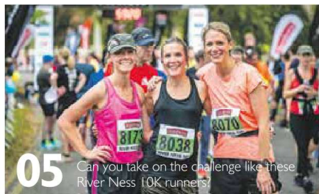
05 Can you take on the challenge like these River Ness 10K runners?