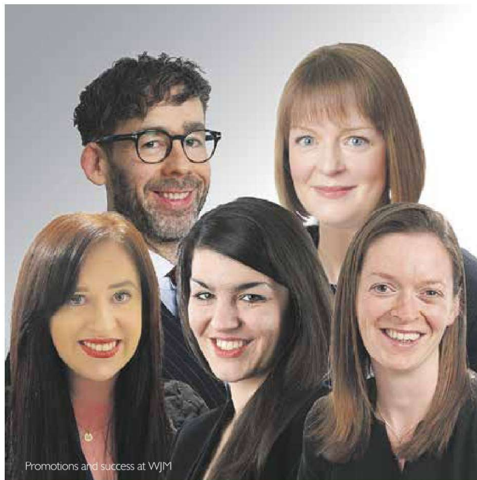
Promotions and success at WJM