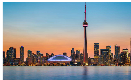
Canada (Ontario Region)