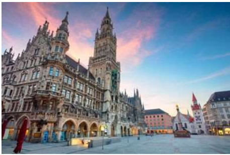
Germany (Munich & Augsburg)