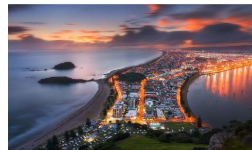
New Zealand (Auckland, Wellington & Tauranga)